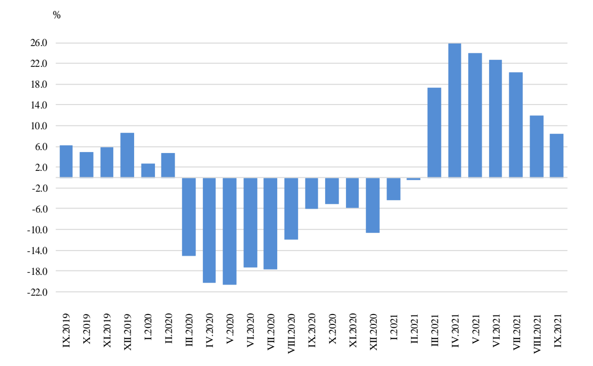
Figure 3. Change of turnover in 'Retail trade, except of motor vehicles and motorcycles' compared to the same month of the previous year (Calendar adjusted)

A growth of turnover in 'Retail sale of non-food products, (except fuel)' was registered in 'Dispensing chemist; retail sale of medical and orthopaedic goods, cosmetic and toilet articles in specialised stores' - by 35.1%, in 'Retail sale of computers, peripheral units and software; telecommunications equipment' - by 13.0%, in 'Retail sale of audio and video equipment; hardware, paints and glass; electrical household appliances' - by 10.3% and in 'Other retail sale in non-specialised stores' - by 3.6%. A decrease was observed in 'Retail sale of textiles, clothing, footwear and leather goods' - by 7.6% and in 'Retail sale via mail order houses or via Internet' - by 2.8%.