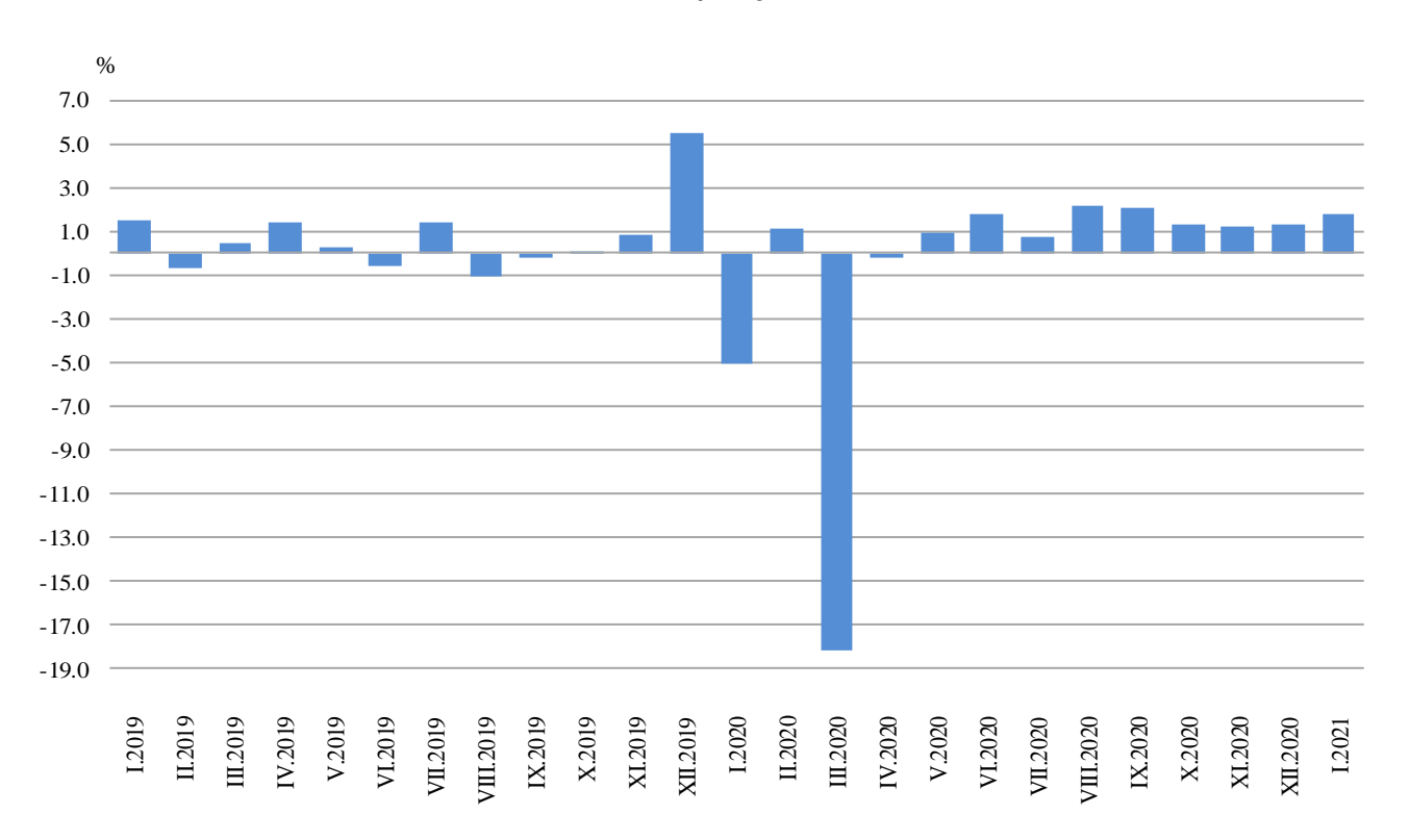
Figure 2. Change of turnover in 'Retail trade, except of motor vehicles and motorcycles' compared to the previous month (Seasonally adjusted)

In January 2021 compared to the previous month, increase of turnover was observed in all major groups: 'Retail sale of non-food products (including fuel) - by 7.1%, in the 'Retail sale of automotive fuel in specialized stores' - by 3.6% and in the 'Retail sale of food, beverages and tobacco' - by 1.0%. In the 'Retail sale of non-food products except fuel' more compelling growth of turnover was registered in the 'Retail sale of textiles, clothing, footwear and leather goods in specialised stores' - by 37.0%, in the 'Dispensing chemist; retail sale of medical and orthopaedic goods, cosmetic and toilet articles in specialised stores' - by 5.8% and in the 'Retail sale of audio and video equipment; hardware, paints and glass; electrical household appliances' - by 3.8%. Significant decline was noted in the 'Retail sale via mail order houses or via Internet' - by 15.4%.