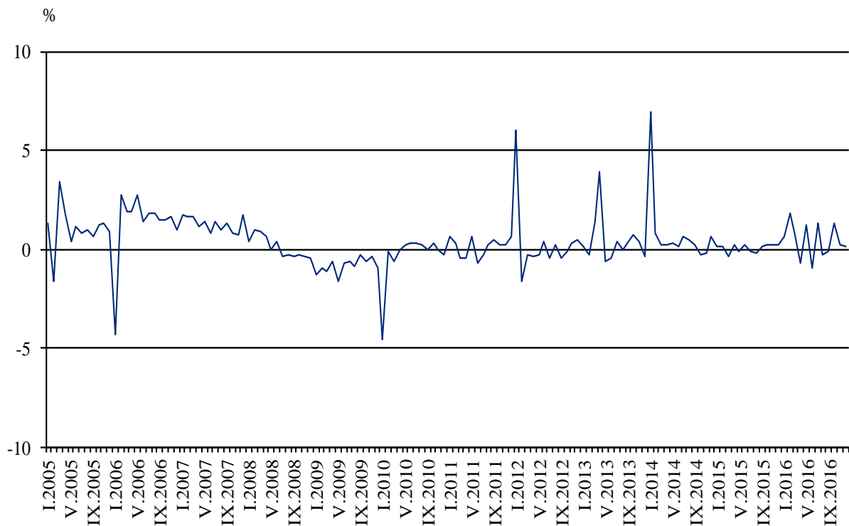
Figure 2. Change of turnover in ‘Retail trade, except of motor vehicles and motorcycles’ compared to the previous month (Seasonally adjusted)

In December 2016 compared to the previous month the turnover increased in the ‘Retail sale via mail order houses or via Internet’ by 5.3%, in the ‘Retail sale of food, beverages and tobacco’ by 0.8% and in the ‘Dispensing chemist; retail sale of medical and orthopaedic goods, cosmetic and toilet articles’ by 0.2%. A decrease was registered in the ‘Retail sale of textiles, clothing, footwear and leather goods’ - 4.8%, in the ‘Retail sale of audio and video equipment; hardware, paints and glass; electrical household appliances’ - 2.1% and in the ‘Retail sale of automotive fuel’ - 0.1%.