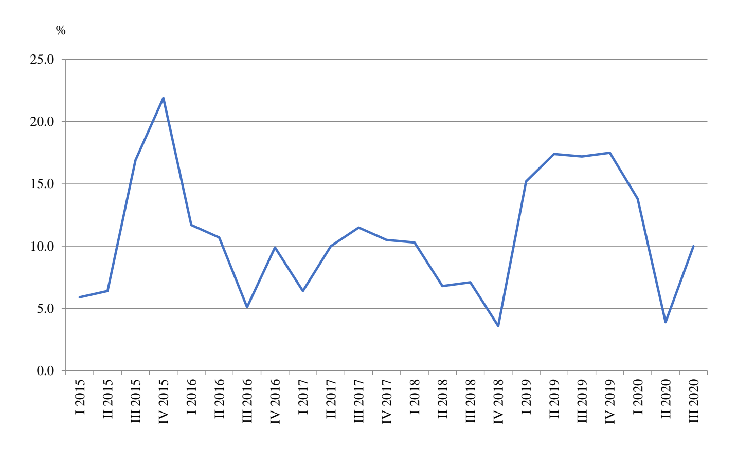
Figure 3. Changes of the turnover index in 'Information and communication' compared to the same quarter of the previous year (Working day adjusted)

In 'Other business services' a decrease was observed in almost activities compared to the third quarter of 2019. The largest drop was in Travel agency, tour operator and other reservation service and related activities - by 70.3%, while the highest growth was seen in Legal, accounting and management consultancy activities - by 16.0%.