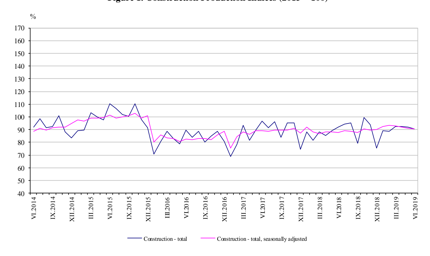
Figure 1. Construction Production Indices (2015 = 100)

In June 2019 working day adjusted data<sup>4</sup> showed an increase by 1.5% in the construction production, compared to the same month of 2018 (Table 3).