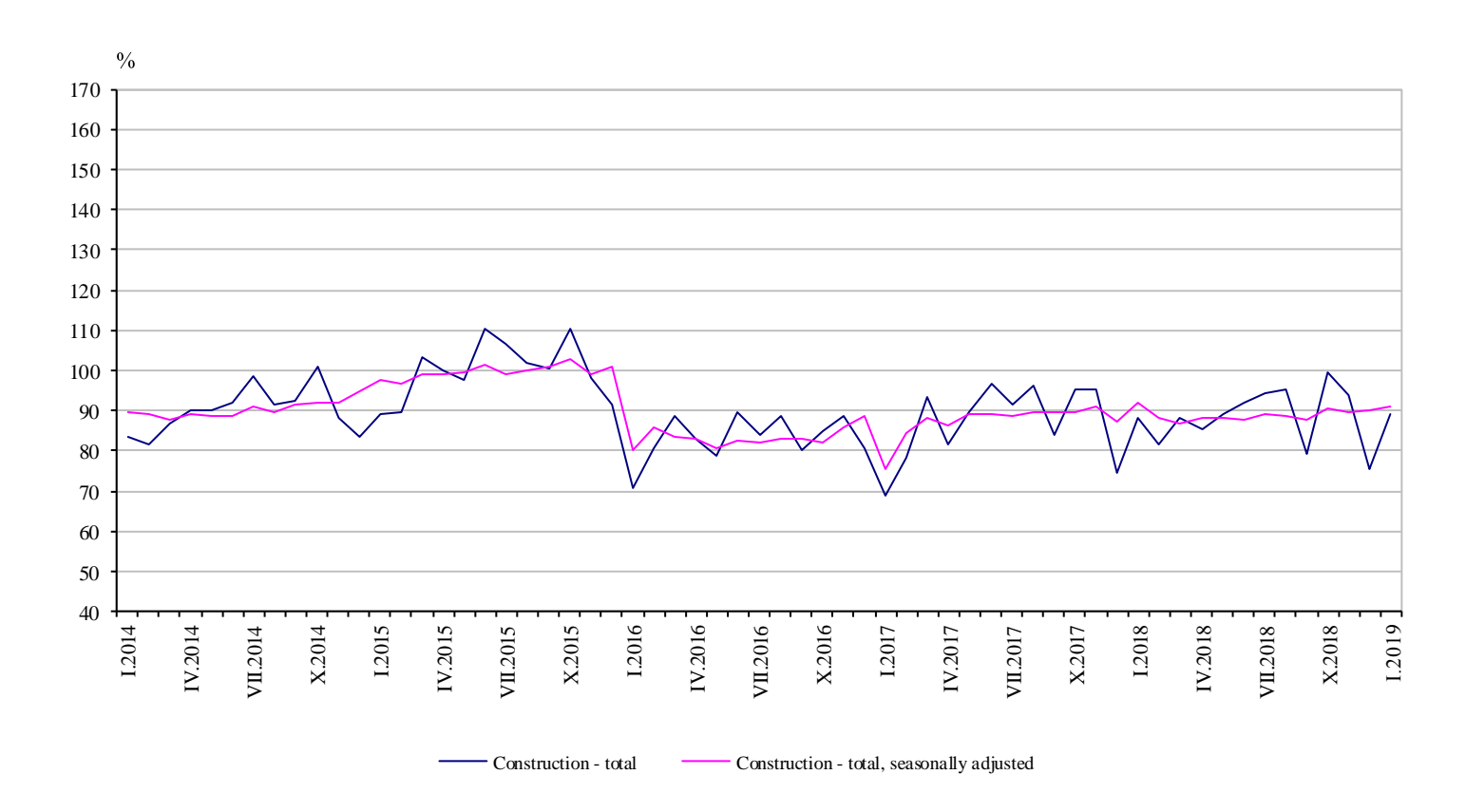
Figure 1. Construction Production Indices (2015 = 100)

In January 2019 working day adjusted data<sup>4</sup> also showed an increase by 0.9% in the construction production, compared to the same month of 2018 (Table 3).