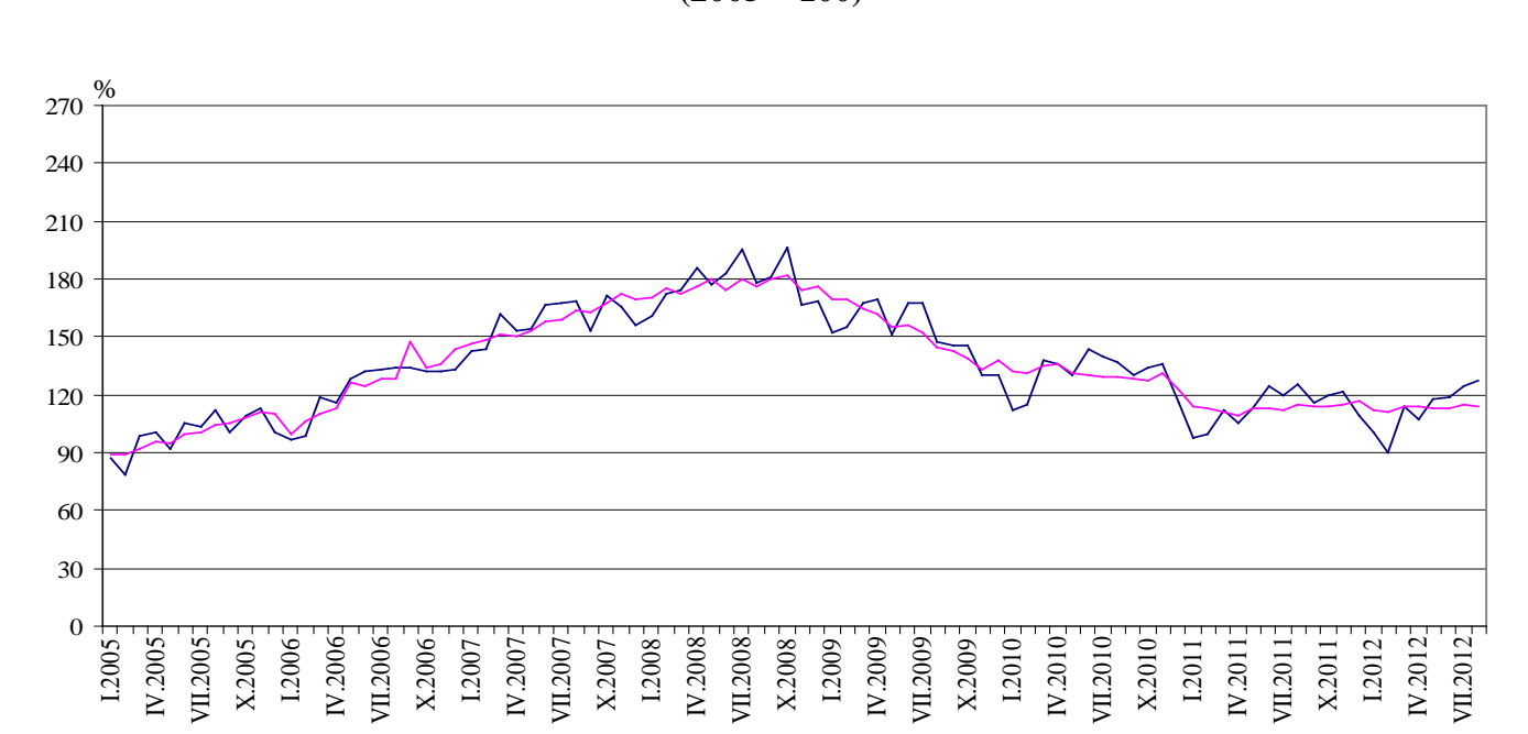
Figure 1. Construction Production Indices (2005 = 100)

In August 2012 working day adjusted data<sup>4</sup> showed an increase by 1.2% in the construction production, comparing to the same month of 2011 (Table 4).