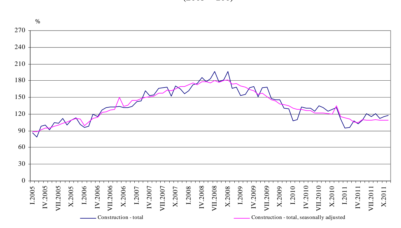
Figure 1. Construction Production Indices (2005 = 100)

In November 2011 working day adjusted data<sup>4</sup> showed a decrease by 10.3% in the construction production, comparing to the same month of 2010 (Table 4).