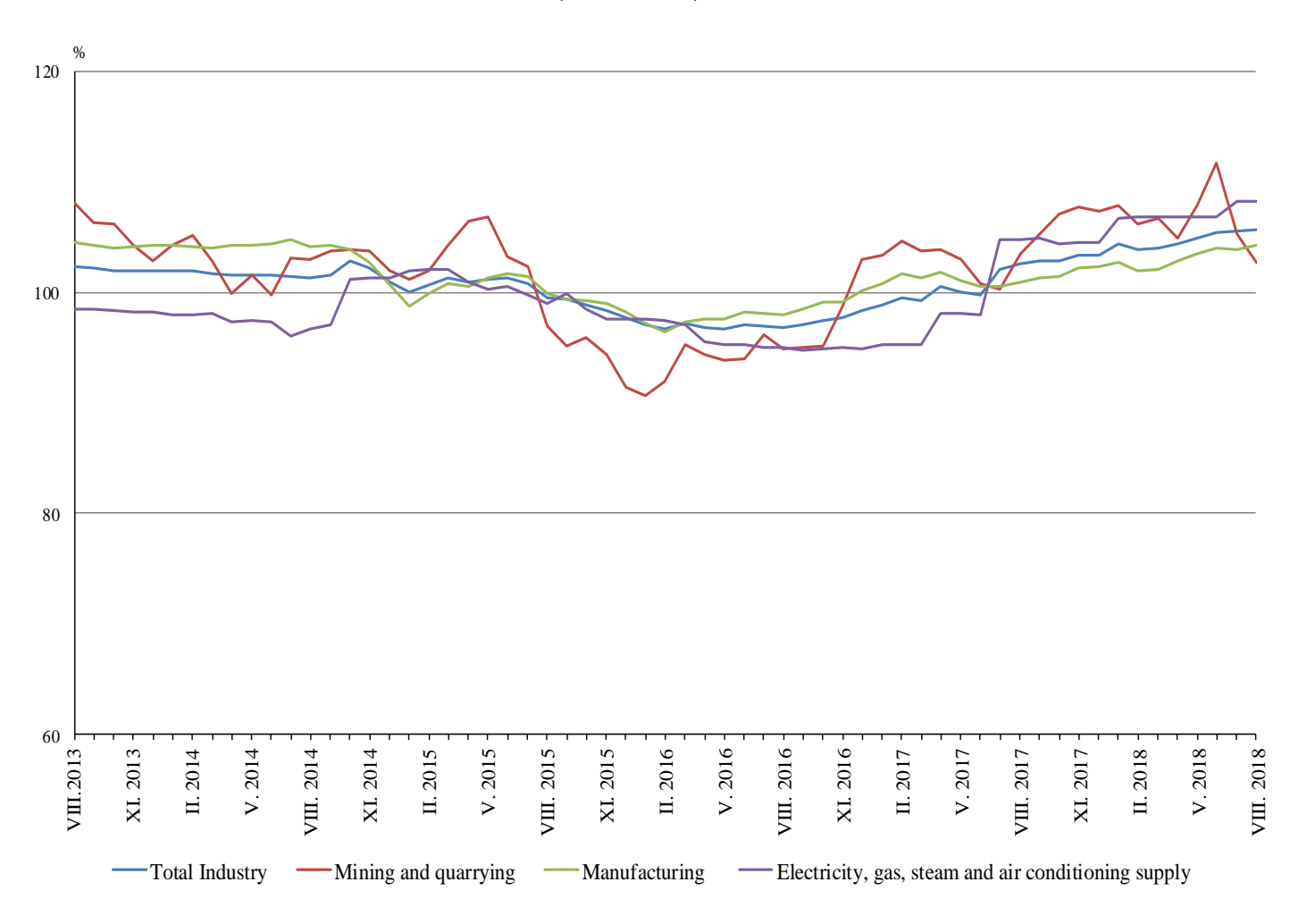
Figure 2. Producer Price Indices on Domestic Market in Industry (2015 = 100)

In the manufacturing compared to August 2017 the prices went up in the manufacture of chemicals and chemical products by 4.7%, in the manufacture of wood and of products of wood and cork, except furniture; manufacture of articles of straw and plaiting materials by 4.6%, and in the manufacture of paper and related products by 4.1%. A decrease in the prices was reported in the manufacture of computer, electronic and optical products by 0.5%, as well as in other manufacturing by 0.4%.