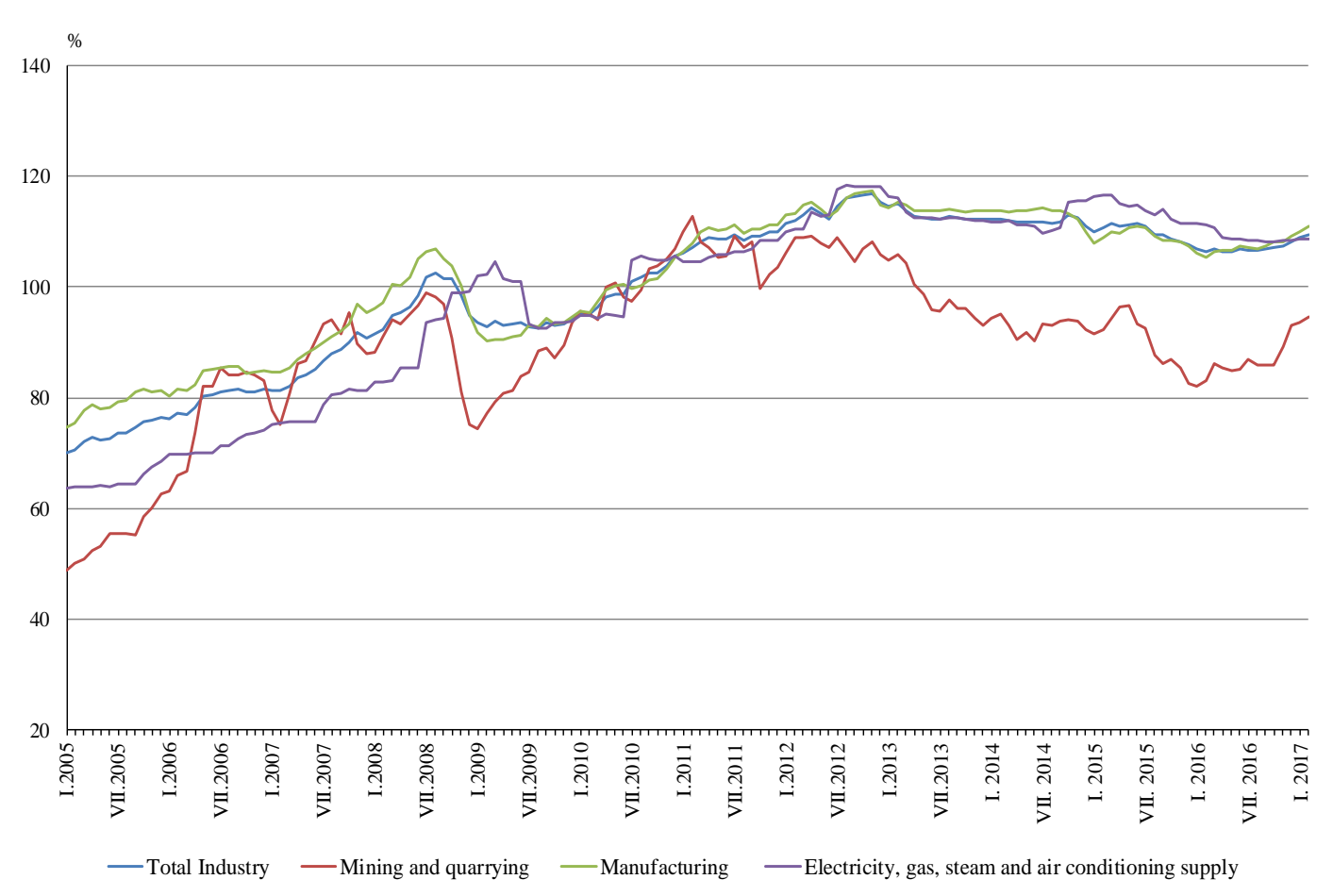
Figure 2. Producer Price Indices on Domestic Market in Industry (2010 = 100)

In the manufacturing compared to February 2016 the prices went up in the manufacture of basic metals by 22.0%, in the repair and installation of machinery and equipment by 4.4% and in the manufacture of tobacco products by 3.7%. The prices decreases were reported in the manufacture of wood and of products of wood and cork, except furniture by 0.7% and in the manufacture of rubber and plastic products by 0.4%.