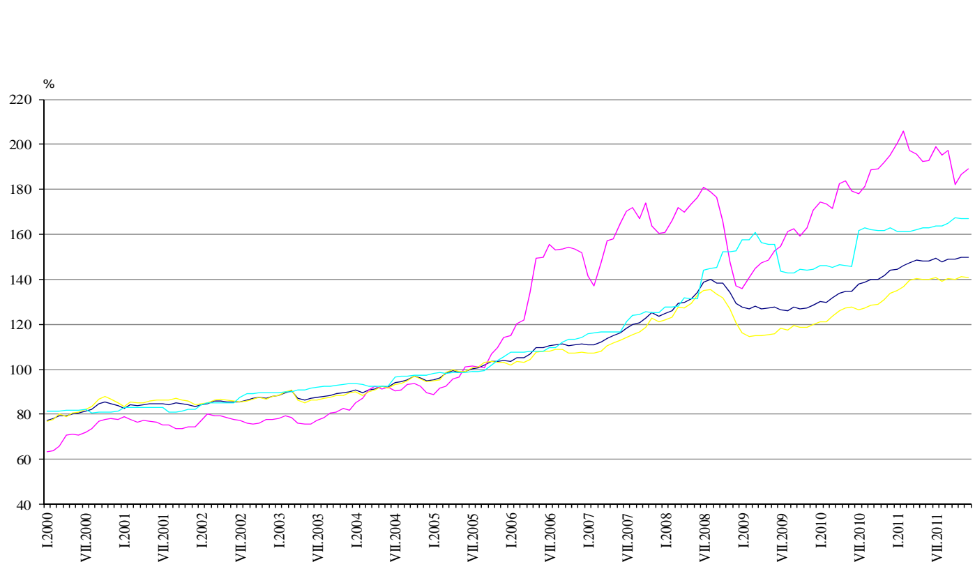
Figure 1. Producer Price Indices on Domestic Market in Industry (2005 = 100)