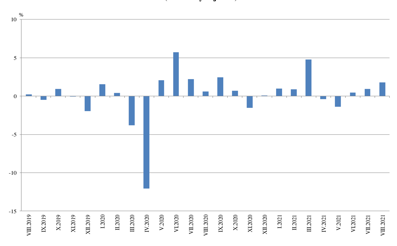
Figure 2. Changes of Industrial Production Indices compared to the previous month (Seasonally adjusted)

The most significant increase in the manufacturing was seen in the manufacture of motor vehicles, trailers and semi-trailers by 21.8%, in the manufacture of textiles by 12.0%, in the manufacture of basic pharmaceutical products and pharmaceutical preparations by 10.0%. Major decrease was seen in the manufacture of tobacco products by 23.6%, in the manufacture of fabricated metal products, except machinery and equipment by 20.0%, in the manufacture of other transport equipment by 8.9%.