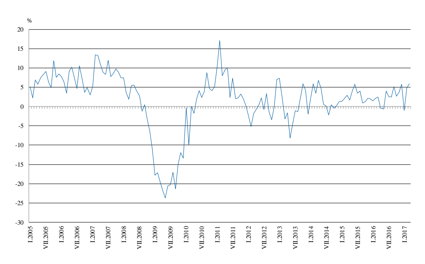
Figure 3. Changes of Industrial Production Indices compared to the same month of the previous year (Working day adjusted)

The final data on Industrial Production and Turnover Indices for February 2017 can be found on the NSI website: <a href="http://www.nsi.bg/en">http://www.nsi.bg/en</a>.