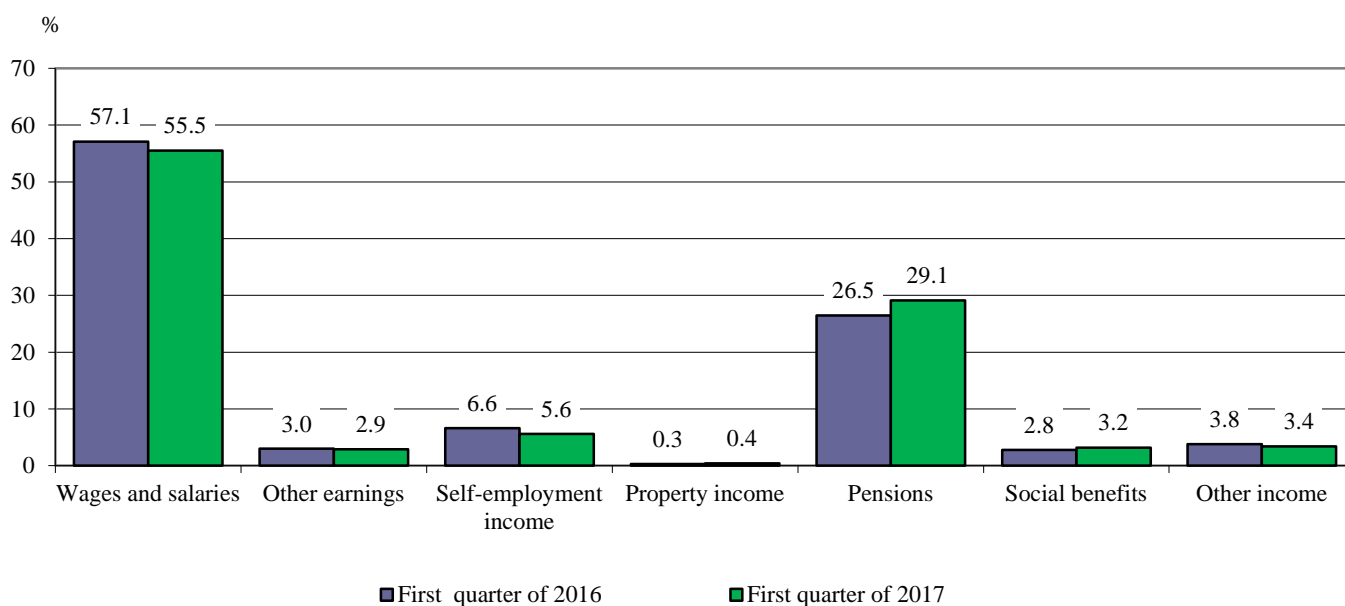
Figure 1. Structure of the total household income during the first quarter of 2016 and 2017

The nominal income by source average per capita during the first quarter of 2017 compared to the first quarter of 2016 changes as follows: