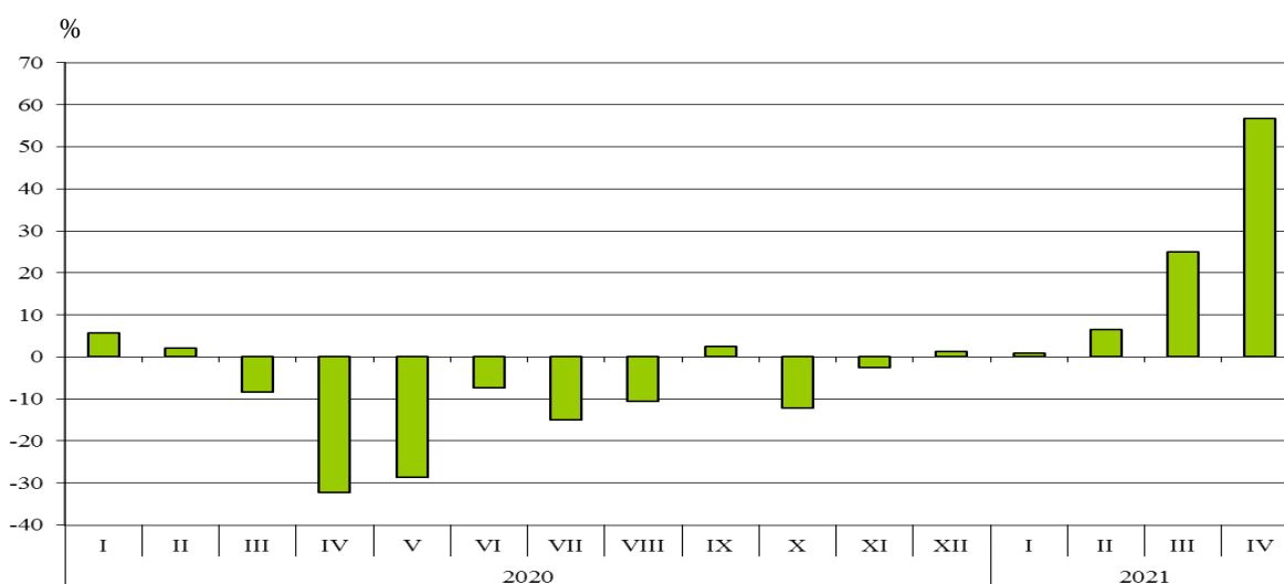
Figure 2. Nominal value 2 change of imports of goods to Bulgaria from EU in the period 2020 - 2021 (Compared to the same month of the previous year)

In the period January - April 2021 in the imports of goods to Bulgaria from the EU Member States, distributed according to the Standard International Trade Classification , the largest growth compared to the corresponding period of 2020 was recorded in the section 'Animals and vegetable oils, fats and waxes' (55.2%). Fall was not observed in none of the sections.