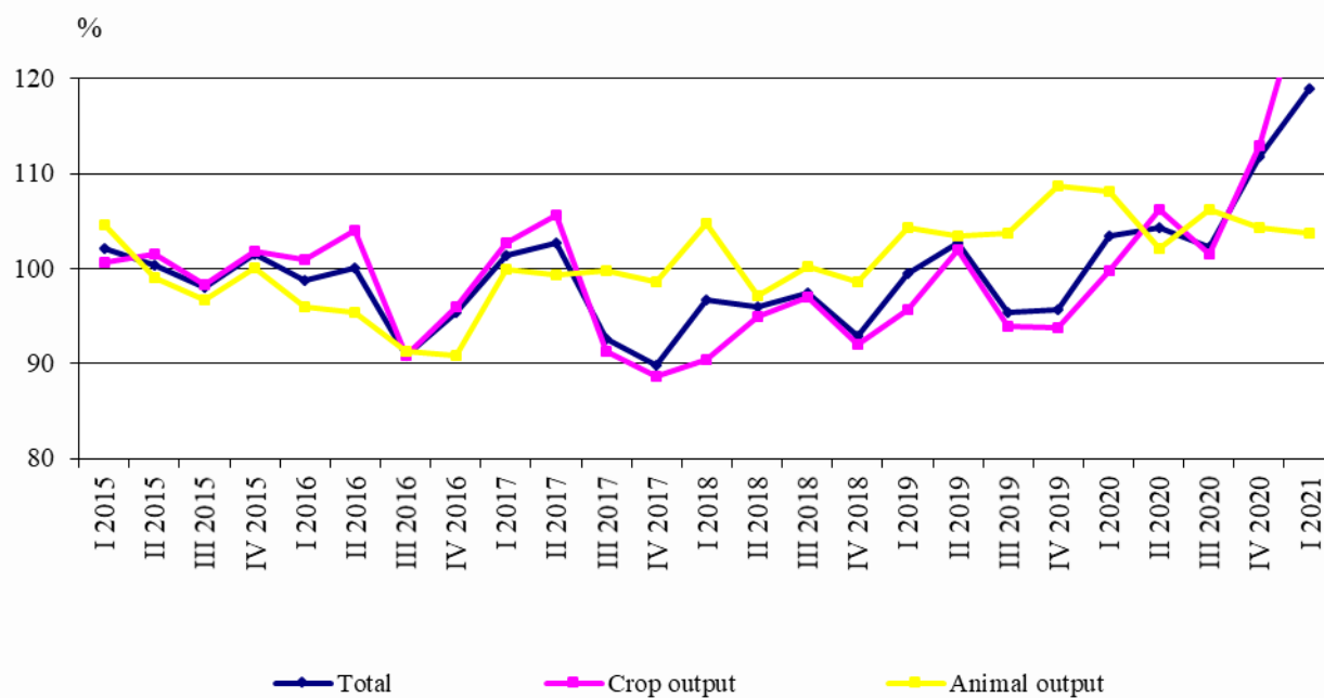
Figure 1. Producer prices indices in agriculture, by quarters (2015 = 100)